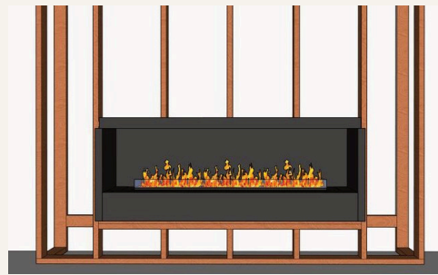
ENCLOSURE — FRAMING DETAIL