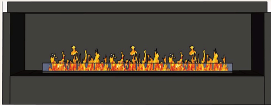
ENCLOSURE — SIDE PROFILE

Engineered for swift, seamless integration, the self-contained unit features discreet access panels, ensuring effortless upkeep without ever compromising the surrounding architectural design. Form and function, resolved as one.